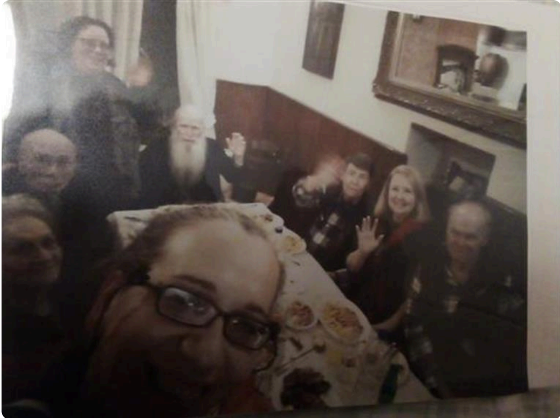
WE MISS YOU BILL A LOT